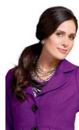
Your name here!!