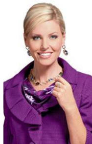
Your name here!!