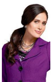
Your name here!!

Will you say YES to RUN with us this year?