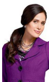
Your name here!!