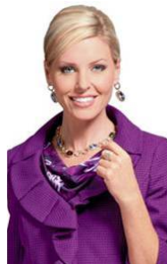
Your name here!!