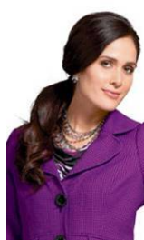
Your name here!!