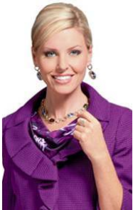
Your name here!!