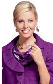
Your name here!!