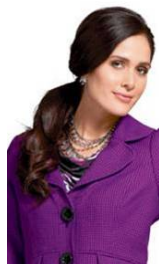
Your name here!!