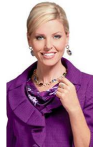
Your name here!!