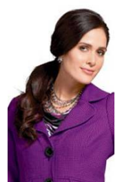
Your name here!!

Will you say YES to RUN with us this year?