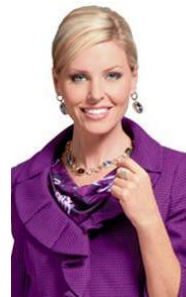
Your name here!!