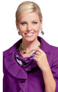
Your name here!!